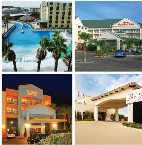
Hotel Motel tax collections are used for tourism, advertising, and promotion.