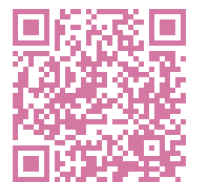
Scan to view more.

Sign up for "RAVE" the City's Emergency Notification System to stay up to date during emergencies.