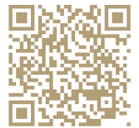
Scan to view more.

As a resident, you can provide details on your properties and more that will be directed to your local law enforcement!