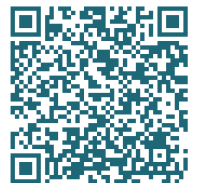
Scan to view more.

The City is encouraging individuals who require special assistance during emergencies to enroll in its Special Needs Registry.