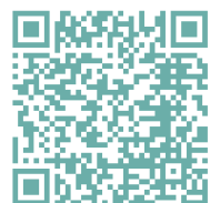
Scan to view more.

If you live and/or own property on South Padre Island register your vehicle for a re-entry sticker.