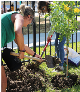
Planting a native tree at the park entrance.

To stay up-to-date on the Parks & Keep SPI Beautiful Committee's events, projects, and more, join them online or in City Hall for the monthly committee meeting and follow them on Facebook !