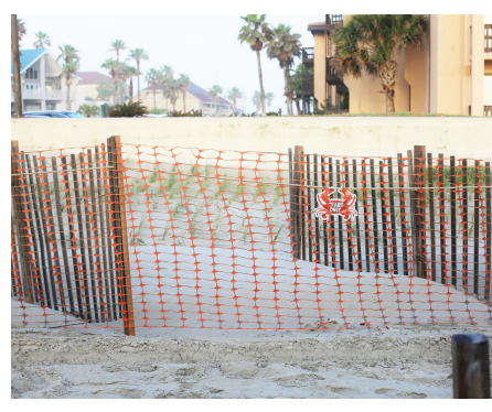
Dune fencing on South Padre Island.