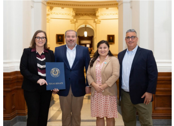
From left to right Senator Morgan LaManita, Mayor Patrick McNulty, Representative Janie Lopez, and City Council Member Joe Ricco.

The City of South Padre Island is honored to receive Resolution H.R. No. 1835 from the House of Representatives and Resolution S.R. 497 from the Senate in celebration of the 50th anniversary of the city’s incorporation. Resolution H.R. No. 1835 and Resolution S.R. 497 delve into the origins of the City of South Padre Island and highlight the natural beauty of South Padre Island.