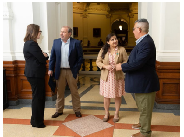
From left to right Senator Morgan LaManita, Mayor Patrick McNulty, Representative Janie Lopez, and City Council Member Joe Ricco.

The community can also enjoy an abundant amount of native flora and fauna. The Island is a major migration destination for over 300 species of birds, is a big nesting spot for sea turtles, and is a participant of the Mayor’s Monarch Pledge. Not only that but there are many plants that beautify the Island from the pretty morning glories to the protected mangroves. South Padre Island truly is the Jewel of Texas.