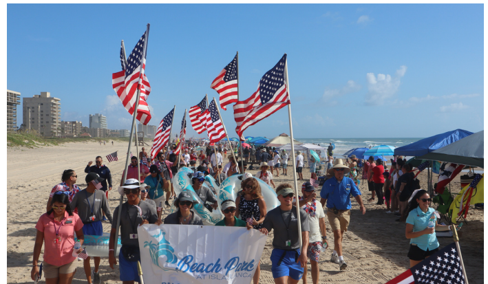
Pictured above is the parade line with various groups such as Beach Park staff, Friends of Animal Rescue, City staff, and anyone from the public that wanted to join in.