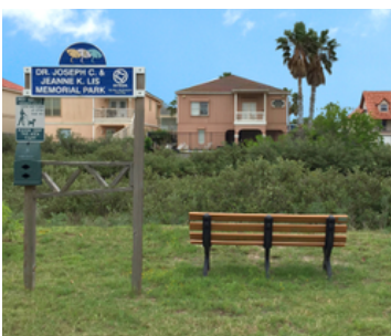
Lis Memorial Park.

Butterfly Park has a picnic area, a butterfly statue, five garden plots, access to the beach, and more!