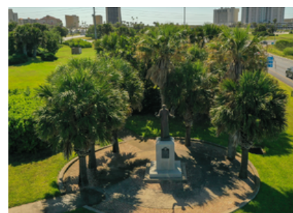
Queen Isabella Memorial Park.