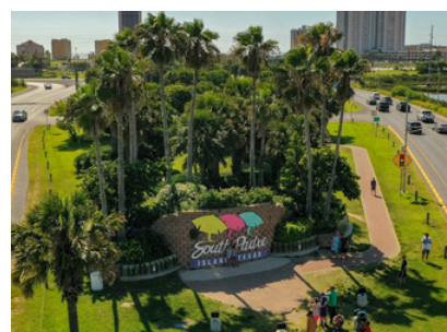
SPI Gateway Project.