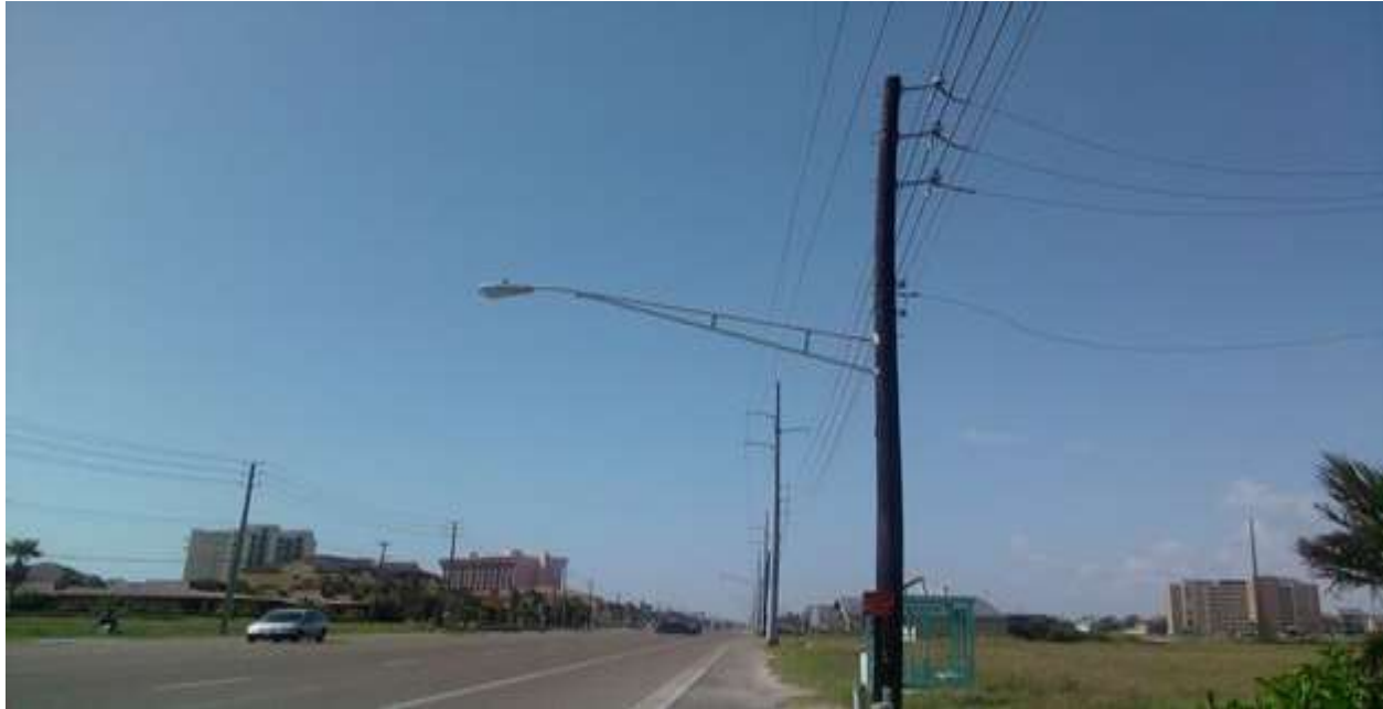
14' Arm with 250 HPS Lighting - (Image of Option 2)

Project Name: Street Lights (Option 1, 2 & 3)